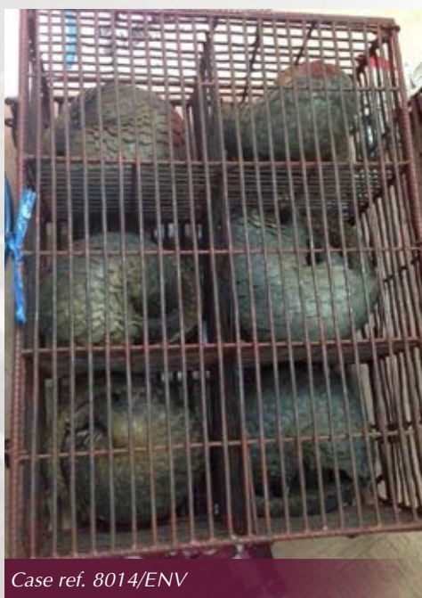
Case ref. 8014/ENV

The following are some great examples of how the courts around the country are taking a stricter position on wildlife crime cases, setting an example for others to follow, and demonstrating their understanding that the law cannot be applied effectively without consequences in the form of punishment, raising the risk for people engaging in illegal activities, and ultimately deterring criminal behavior.