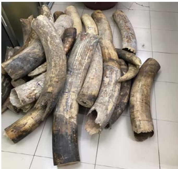
Case ref. 10596/ENV

On January 25, 2017, a total of 423 kilograms of ivory were confiscated from two cars passing through the Thuong Tin toll station in Hanoi. The ivory was suspected to have been in route from Thai Binh Province to Nhi Khe Village (an ivory trading hotspot). Three subjects were arrested, all residents of the same district in Hanoi, one of whom is suspected to be a large scale ivory trader. All three subjects were prosecuted. (Case ref. 10596/ENV)