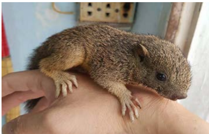
A squirrel was advertised on Facebook. Squirrels are also commonly sold as pets without papers proving their legal origin. (Case ref. 10825/ENV)

On April 16, 2017, Lang Son Traffic Police seized 11 dead squirrels, 17 skinned civets, and three live common palm civets ( Paradoxurus hermaphroditus ) from a motorbike rider travelling from Lang Son Province to Bac Giang Province. The subject was fined VND 6,000,000 (USD $266) and the dead wildlife incinerated. (Case ref. 10845/ENV)