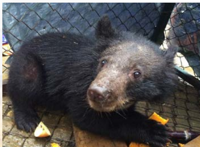
Case ref. 10584/ENV

subject. The police confiscated the bear on the same day, and the bear was transferred to Hoang Lien Rescue Center. (Case ref. 10584/ENV)