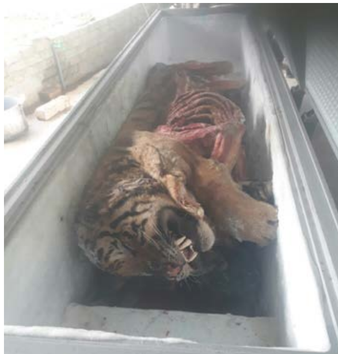
(Case ref. 10722/ENV)

On March 20, 2017, Central Anti-smuggling Police and Dien Chau District Police inspected a residential house following an investigation into a suspected tiger trader. Within the house, the police found five frozen tigers, four of which had been disemboweled and partially stripped of their meat. The owner of the tigers was not present at the time of confiscation, and was reputedly in Laos. (Case ref. 10722/ENV)