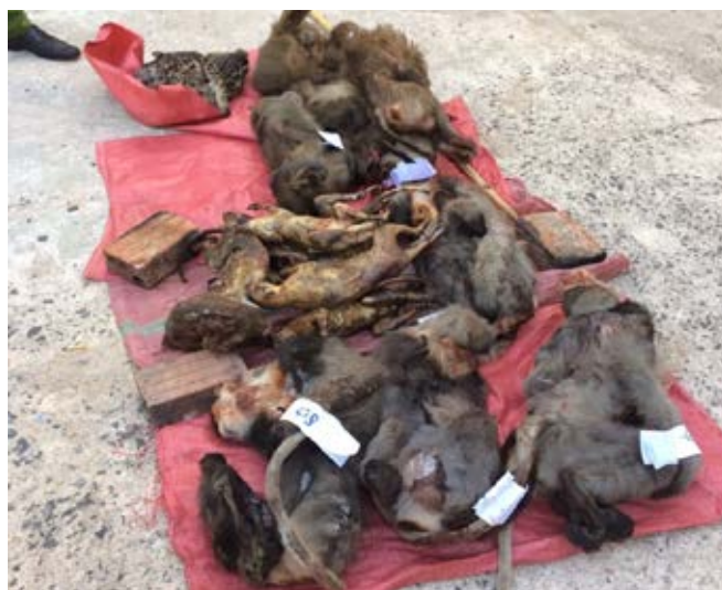
Amongst the confiscated wildlife were four dead grey-shanked douc langurs, a critically endangered primate species endemic to the central provinces of Vietnam.

On February 7, 2017, Gia Lai Environmental Police (EP) and Mang Yang District Police seized four grey-shanked douc langurs ( Pygathrix cinerea ), two leopard cats ( Prionailurus bengalensis ), five macaques, and seven squirrels from a wildlife trader. Altogether, the wildlife weighed 72 kilograms. The wildlife had been kept in the freezer of a grocery shop of the trader. The trader had reportedly sourced the animals from ethnic people. The case is under investigation. (Case ref. 10617/ENV)