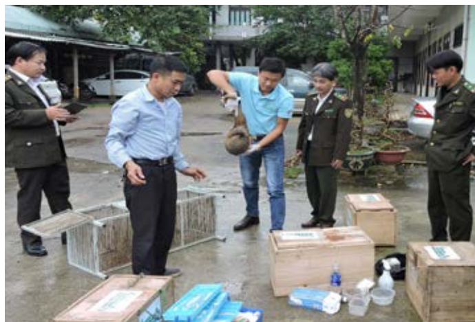
Da Nang FPD inspects pangolins discovered in a suitcase left in a hotel lobby.

On January 2, 2017, Tan Chinh Ward Police with Central Anti-smuggling Police, Da Nang FPD, and Thanh Khe District Police seized four Sunda pangolins ( Manis javanica ) at a hotel in Da Nang. Hotel staff had become suspicious of a piece of luggage left in the hotel lobby. Upon inspecting the luggage, authorities found four live pangolins. Police determined that a subject had been paid to transport the pangolins to Da Nang from Kon Tum Province via bus. The subject was later apprehended when he appeared at the hotel to retrieve the luggage. The pangolins were transferred to the Carnivore and Pangolin Conservation Program (CPCP) in Cuc Phuong National Park. (Case ref. 10538/ENV)