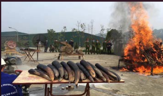
Lao Cai authorities took it upon their own volition to destroy confiscated ivory, a good example for other provinces to follow. Case ref. 8782/ENV

While the late 2016 destruction of ivory in Hanoi marked a very positive step forward for Vietnam in dealing with growing stockpiles of confiscated ivory and rhino horn, a much quieter and equally important event occurred in Lao Cai Province in February 2017. In the Lao Cai case, provincial authorities on their own volition destroyed 43 pieces of ivory that were confiscated in an August 2015 smuggling case. While this may be considered a small quantity of ivory when compared to the estimated 46 tons of ivory currently held in stockpiles, it is significant in that it reflects how some provinces are taking the initiative and moving forward in doing the right thing.