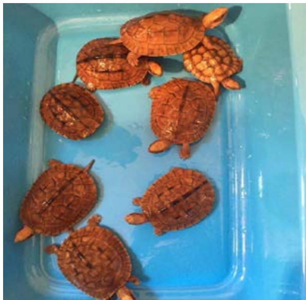
Another tough internet case to crack. Juvenile three-striped box turtles, ( Cuora trifasciata ) offered for sale in Ho Chi Minh City (HCMC) along with a dozen or more other turtle species. In this case, the trader was identified and the case is currently in the hands of HCMC authorities to address. Case ref. 10880/ENV

On January 8, 2017, Huong Son District Police acted upon a tip-off and stopped a bus which was travelling from Laos to Nghe An Province. Police seized nine Sunda pangolins ( Manis javanica ), an elongated tortoise ( Indotestudo elongata ), and four Asian leaf turtles ( Cyclemys tchaponensis ) weighing 28 kilograms in total. The pangolins were transferred to the Carnivore and Pangolin Conservation Program and the turtles were transferred to the Turtle Conservation Center at Cuc Phuong National Park. The coach driver and his assistant claimed that they had been hired to transport the wildlife. Both subjects have been prosecuted. (Case ref. 10555/ENV)