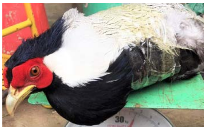
A silver pheasant offered for sale on Facebook by a major bird trafficker in a northern province. A more effective approach is needed to address internet crime in Vietnam, which has grown substantially in recent years. Case ref. 10583/ENV

On April 31, 2017, Ha Tinh EP inspected a grocery store in Ha Tinh City and confiscated a stump-tailed macaque ( Macaca arctoides ) and two pig-tailed macaques ( Macaca leonina ) weighing nearly 50 kilograms collectively. The macaques were released into a protection forest. (Case ref. 10847/ENV)