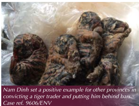
Nam Dinh set a positive example for other provinces in convicting a tiger trader and putting him behind bars. Case ref. 9606/ENV

In 2016, a tiger trader in Nam Dinh Province was sentenced to 42 months in prison after he was caught with four frozen tiger cubs. (Case ref. 9606/ENV)