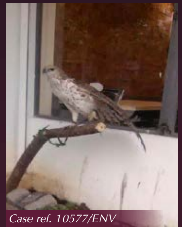
Case ref. 10577/ENV

Another similar case occurred in a northern province. In this case, a member of the public reported to ENV that a raptor was being kept at a restaurant in the city. Local authorities responded to the case, but did not confiscate the bird. Instead, local authorities reportedly allowed the owner to keep it, which was a decision that is in conflict with the law. In addition to permitting the owner to keep a raptor that was most likely not of legal origin, the presence of the captive bird in the restaurant sends the wrong message to restaurant patrons, suggesting that it is acceptable to keep illegal wildlife, and potentially motivating others to purchase and keep wild animals. Such occurrences also undermine the respect of the people for local authorities. This is an example of openly violating the law without any recourse, which in turn undermines the rule of law (Case ref. 10577/ENV).