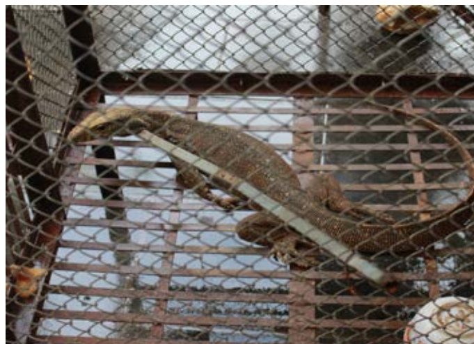
Monitor lizards being kept at a church. This is just one of a number of recent cases where wild animals, including gibbons and other fully protected species, have been reported at churches, mainly in the south of Vietnam.

Note: This case represents an excellent example for other provinces to follow. The administrative punishment of 40,000,000 VND (USD $1,768), combined with the confiscation of wildlife, represents a sufficient level of punishment to deter further violations. Further monitoring and inspections of the restaurant will determine if this is indeed true.