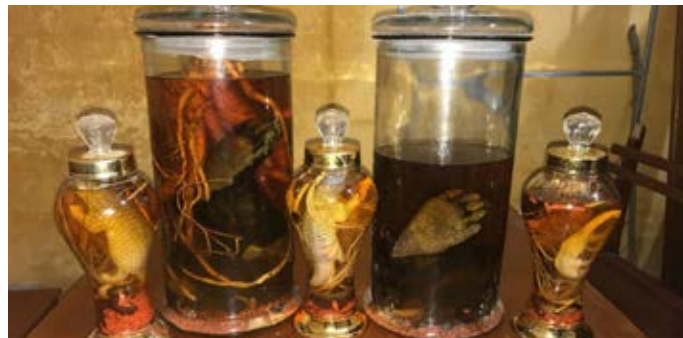
Bear paws in wine were amongst the wildlife products confiscated during the Ha Tinh raid. Case ref. 8467/ENV

online wildlife trader in Ha Tinh. The subject was arrested with two wine jars containing pangolins. A further search of the subject's house revealed 15 pieces of suspected carved ivory, a rifle, nine swords, a machete, opium, marijuana, nine bear paws, and six wine jars containing wildlife (including pangolins, bear paws, and monitor lizards). The subject had been a member of the Brothers from Three Regions wildlife trading group. The subject was sentenced to 15 months in prison. (Case ref. 8467/ENV)