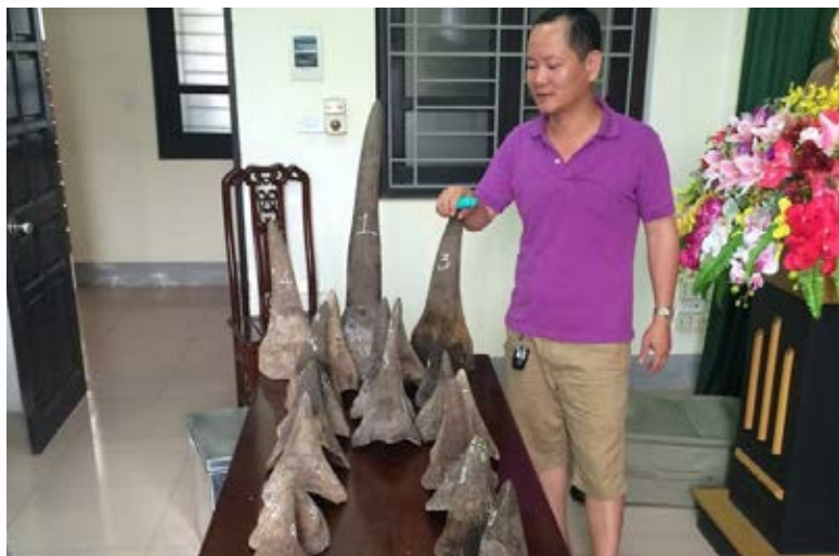
In May 2015, an important smuggling case in Nghe An involving the seizure of 31 rhino horns, resulted in a suspended sentence for the two traffickers, one of which was directly linked to a rhino trafficking network. Case ref. 8380/ENV