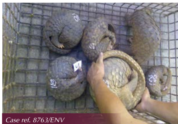
Case ref. 8763/ENV

Likewise, in Hanoi and Nghe An Province, two pangolin traders caught by police with 13 and 11 pangolins respectively, each received nine months in prison. In Hai Phong, the courts issued prison sentences of 7-12 months to four defendants caught smuggling 52 pangolins. ( Case ref. 8206, 8763, 8204/ENV )