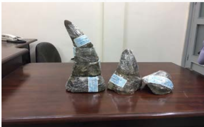
Case ref. 10820/ENV

On April 14, 2017, a total of 4.8 kilograms of rhino horn ( Diceros bicornis ) were confiscated from two Vietnamese passengers who had arrived at Tan Son Nhat Airport from Luanda, Angola via Dubai. In total, three rhino horns had been cut into seven separate pieces and wrapped in tinfoil and hidden within cardboard boxes inside checked luggage. (Case ref. 10820/ENV)