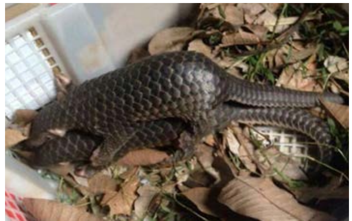
Pangolin scales are used in traditional medicine in Vietnam and meat is sold at some restaurants. However a majority of the live pangolin and pangolin scale trade is destined for markets in China. (Case ref. 10659/ENV)

Also on March 3, 2017, Noi Bai Customs opened a shipment of pangolin scales that had been sent to Vietnam from Cameroon. Twenty-five carton boxes containing 387.5 kilograms of pangolin scales were seized from a shipment which had been flown from Yaoundé in August 2015, but remained unclaimed until the March inspection. (Case ref. 10687/ENV)