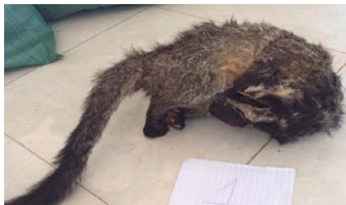
Case ref. 10615/ENV

On February 8, 2017, following a tip reported to the ENV Wildlife Crime Hotline, Gia Lai EP inspected a suspected wildlife trade operation and confiscated three masked palm civets ( Paguma larvata ) and one common palm civet ( Paradoxurus hermaphroditus ). All four civets were frozen and the trader claimed that they were gifts for his family and friends. The trader was fined VND 3,000,000 (USD $133) and the civets were incinerated. (Case ref. 10615/ENV)