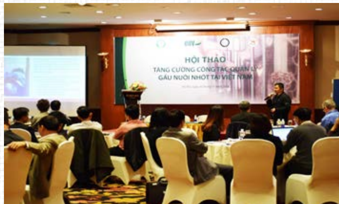
In late 2016, forest Protection Department leaders from key bear farm provinces met in Hanoi to provide inputs to a new strategic roadmap aimed at expediting an end to bear farming in Vietnam.

In 2016, a coalition of non-governmental organizations including World Animal Protection, Four Paws International, and ENV was formed to support efforts by the Government to expedite an end to bear farming in Vietnam through implementation of a “road map”. The new initiative was preceded by a stakeholder workshop in November 2016 involving leaders of the Forest Protection Department (FPD) from provinces throughout the country with high concentrations of bears on farms. During this meeting, FPDs contributed their ideas to the road map. The first phase was initiated in January 2017.