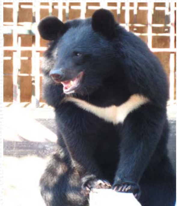
One of many bears confiscated or transferred from bear farms as part of the phasing out of bear farming initiated in 2005.

Other organizations that are working independently on ending bear farming include Animals Asia Foundation and Free the Bears, each of which ENV recognizes as positively contributing to the broader effort to end bear farming in Vietnam.