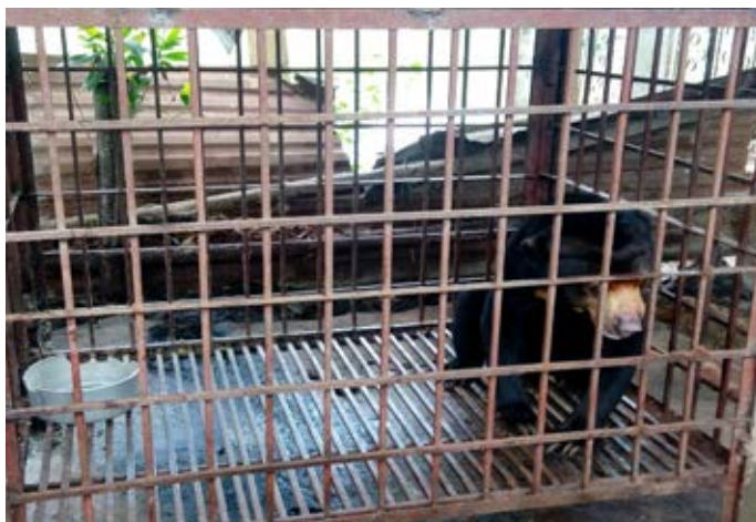
Case ref. 10633/ENV

On February 14, 2017, Soc Son Rescue Center received a Malayan sun bear ( Helarctos malayanus ) from a military dog training facility in the Ba Vi District of Hanoi. The bear had been hunted and taken from a forest years prior. Hanoi FPD confiscated the bear on the same day that it was transferred to Soc Son Rescue Center. (Case ref. 10633/ENV)