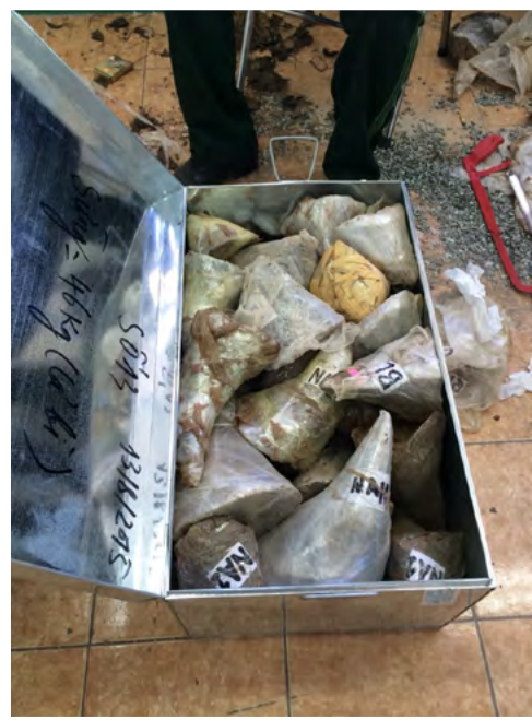
Some of the ivory and rhino horns confiscated in Da Nang during several major seizures in August