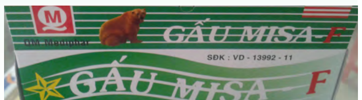
MISA bear bile cream was widely sold at pharmacies and in stores in Vietnam

The excellent work of the Department of Health in Ho Chi Minh City in dealing with this case is an example that should be followed by authorities in other provinces whenever commercial health products containing endangered wildlife are discovered.