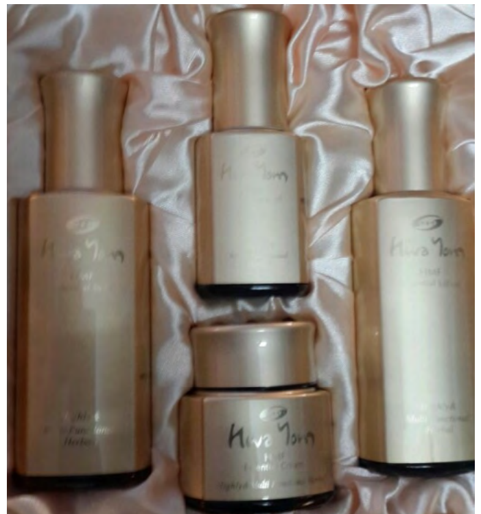
Korean cosmetics containing bear bile were being sold in Vietnamese markets

containing wildlife. The findings of the survey also suggest that the lower the education of the respondents, the higher chance that they will use health products containing wildlife. This study suggests that demand for health products containing wildlife will remain high even when supplies of commercially available products are reduced. In order to successfully reduce the market for such products, enforcement agencies must ensure that supplies are diminished and violations involving manufacturers, healthcare providers, traditional medicine doctors, and pharmacies are effectively addressed. Enforcement efforts must also coincide with continued emphasis on reducing consumer demand. Breaking the chain requires active involvement targeting both the supply and demand sides of the equation.