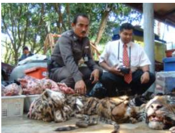
October 2003 bust by Thai police of wildlife slaughterhouse outside Bangkok.

billion (US$ 36.5 million) from a long-standing criminal syndicate linked to trafficking of tigers, pangolins and rosewood, which included, Daoreung Chaimas, considered to be one of Southeast Asia's biggest tiger dealers. 72 Chaimas owns the Star Tiger Zoo in Chaiyaphum, Thailand and has been arrested for trafficking tigers from Malaysia and Thailand to Vietnam via Lao PDR. Despite DNA evidence proving the laundering case and her assistants testifying against her, she had never been prosecuted. 73 The Star Tiger Zoo does not appear on the list of facilities licensed to keep and breed tigers in the information provided by the Thai CITES Management Authority for CITES meetings, yet it has been able to continue operating.