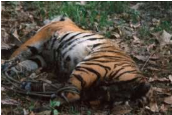
Wild tigers in India and Nepal continue to be poached for their skins. In May 2012, poachers were “commissioned” to source 25 tiger skins.

Tigers are endangered in the wild, with as few as 3,000 47 remaining, and some subspecies are either extinct or critically endangered. Trade continues to be the “primary threat” for the survival of wild tigers and has led to their recent disappearance from areas of otherwise suitable habitat. 48 In India, where the world’s largest wild tiger population exists, estimated at 1,700 tigers, 49 more than 42 tigers were killed in 2013 alone. 50 Poaching of wild tigers and other big cats as a substitute for tigers is driven by demand principally from China and Vietnam.