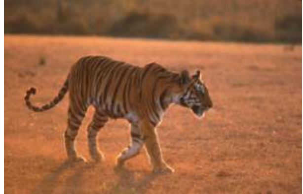
Given the highly endangered status of tigers, there should be zero tolerance of all trade in all parts of tigers from all sources.

attention and fortitude it deserves. The result is that captive facilities have proliferated throughout China and South-East Asia, and trade in both wild and captive-sourced tigers continues ( see Table 1), both of which significantly threaten the existence of tigers in the wild.