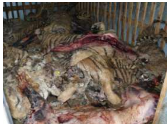
Freezer full of carcasses at the Xiongsen Bear and Tiger Village in China, 2007.

Stockpiles: China's captive tiger population also raises serious concerns about the likely burgeoning stockpiles of tiger bones and skins. When tigers die, the breeders are supposed to “seal” the bones and label the skins. 90 The two largest facilities in China have over 2,000 live tigers between them, and have been found to have freezers full of carcasses. 91 China has recently reported that an unspecified portion of the stocks held by these two breeders has been periodically destroyed. No information on number of carcasses, weight of bone or number of skins destroyed and remaining in stock has been provided. The remaining captive tiger population of approximately 3,000 are found in smaller facilities across China. No information has been provided on how China manages stockpiles on these facilities, though it is evident that skins from some zoos are being licensed for domestic trade. There is apparently no plan to consolidate and permanently destroy stockpiles, putting them beyond commercial use.