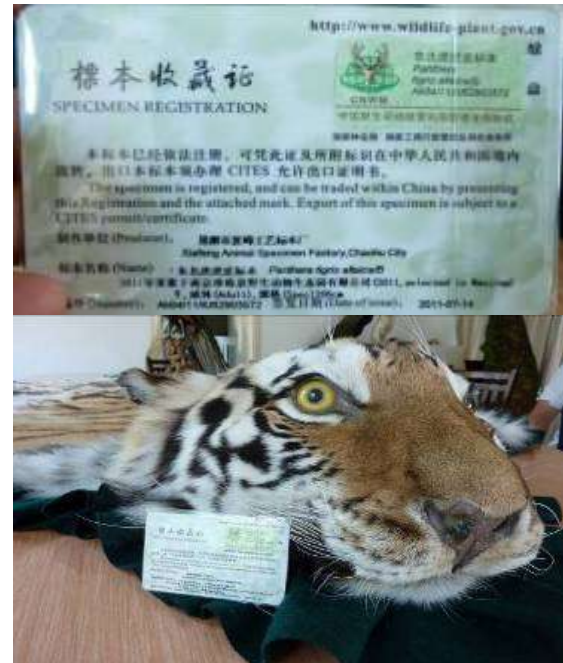
Permit issued by the Government of China for a tiger skin rug sourced from a captive bred-tiger. The permit specifically states that this tiger specimen can be traded within China.

The licensing system for skins of captive bred tigers provides a means of laundering illegally acquired tiger specimens. In 2012, the owner of Xia Feng Taxidermy in Chaohu, Anhui Province - a company licensed to legally trade in skins of captive tigers - described to NGO investigators the ways in which the certification scheme is abused. For example, Government-issued permits can be re-used since the photo ID on the certificate is insufficient for law enforcement officers to compare stripe patterns. The owner also showed NGO personnel the remains of a carcass in his freezer and confirmed he had a buyer for the bones. Even after this was exposed in 2013, 97 permits continue to be issued to Xia Feng. Official records reveal that this taxidermist obtained approval to process 40 tigers and one leopard from zoos between 2010 and April 2014. Of significant concern is that 19 of the 40 permits issued were for carcasses, apparently in violation of the requirement to seal bones. 98