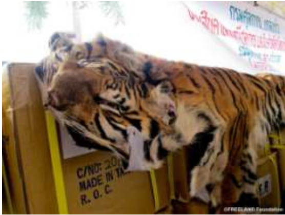
Royal Thai customs confiscated tiger skin, January 2012.

Lack of meaningful prosecution and conviction for offenders: Annex 1 provides a list of incidents and in general the penalties imposed are restricted to fines only.