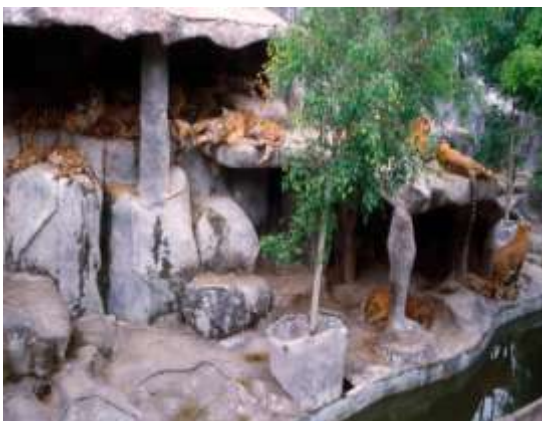
Tigers kept in these conditions serve no conservation purpose.

It is pertinent to note that the wild tiger populations of those range states that have permitted the growth of facilities which keep and breed tigers for commercial purposes are dwindling, and in some cases are believed to be virtually extinct ( see Table 1).